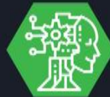
ARTIFICIAL INTELLIGENCE & MACHINE LEARNING