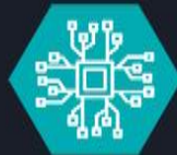
BIG DATA & ANALYTICS