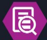
OPTICAL CHARACTER READER